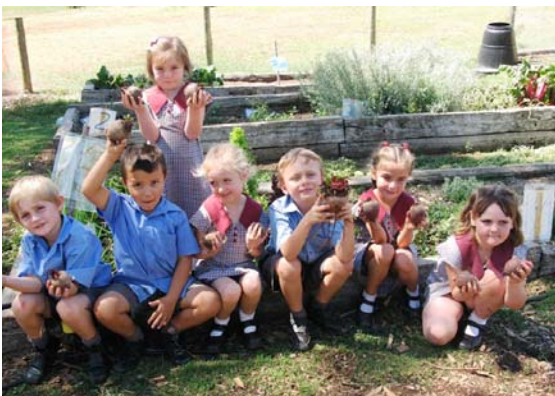
Budding gardeners in Kindergarten