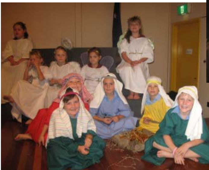
Three very wise little men, some shepherds and dainty angels enjoying taking part in the nativity play at our annual Scripture Service on Tuesday.