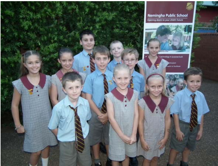
Nemingha Public School Service Award Winners for 2010